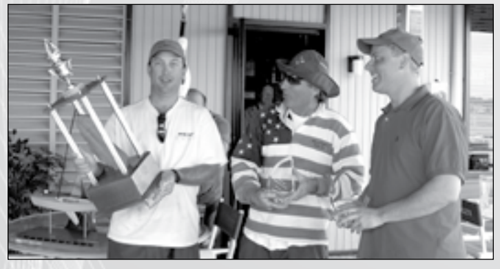
Mid Continent Regatta, Carlyle Sailing Association