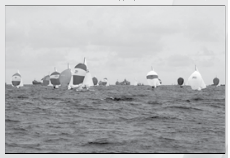
Day 5: The final day of sailing at the Heineken Lightning Nigerian Nationals would take place in the ocean. After spending Saturday in the volatile bay, I personally looked forward to the type of racing I am more used to.

Tomorrow we will sail out of Lagos Harbor and attempt three races in the Atlantic. Steve and I are looking forward to the type of racing we know in the Lightning; however, we've had some fun in the harbor with the current, shipping traffic, volatile wind, etc.