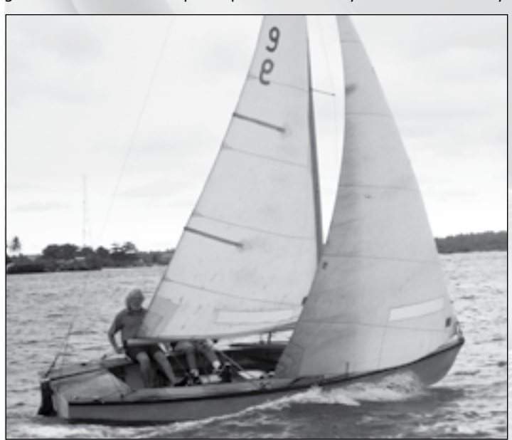
Tarpon rigged with Genoa

We started the Lightning Lab with a brief outline of what we'll cover in the coming days, which for today included a rig tune session. We wanted participants to hit the water so we could quantify our settings and video our handy work. The session gained more and more participants as the day wore on. It is truly