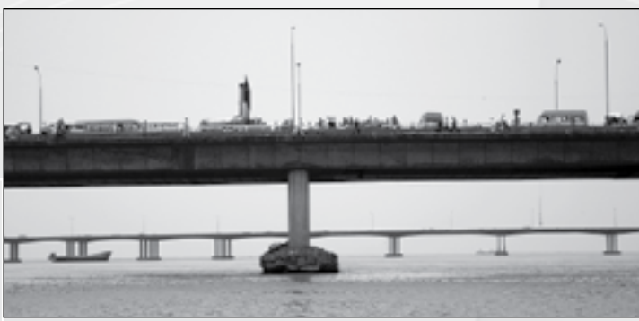
Traffic to Lagos Island

In 1946, the Lagos Yacht Club was searching for a new one-design boat to sail and race. Their venue consisted both of inland harbor and ocean water racing. They chose the Sparkman/Stephens designed Lightning. Since it was built from local materials (rainforest mahogany), it was PAINFULLY heavy. That's OK, because there were about twenty more built shortly thereafter... all pretty much the same weight. To get these overbuilt boats through the water, the locals developed a Genoa (about 120%) that helps power them through the varying conditions. It also puts them on pace with the modern fiberglass Lightnings, so they all can sail together. Interestingly, the "Tarpons" (named after the first boat) have a Genoa winching assembly in the middle of the boat.