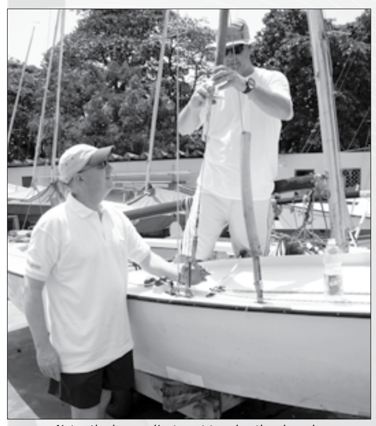
Note: the lever adjustment to relax the shrouds

Lindy made sure that we were on schedule for the purpose of our trip...supporting the Lightning sailors. We arrived at the Lagos Yacht Club precisely at 1:00 PM to more rain. It subsided enough that we were able to tune more boats and even go for a brief sail (both Steve and I had been in motor boats exclusively until this point). After our sail, we reviewed the video from the previous day and previewed today's drills.