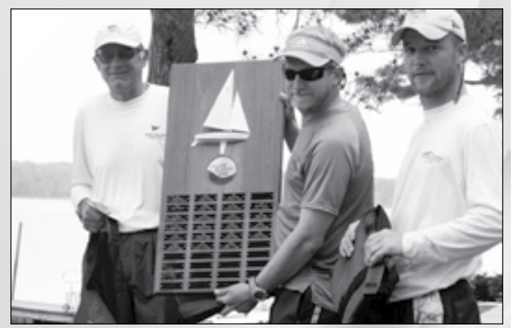
MBBC Spring Regatta, Malletts Bay Boat Club, Fleet 301