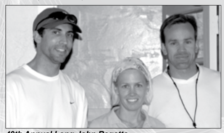
49th Annual Long John Regatta Monmouth Boat Club, Fleet 70