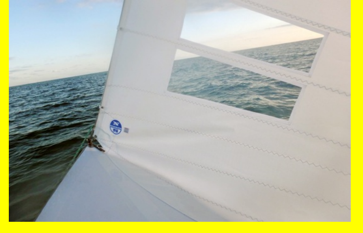
Example of an allowable Jib window according to the proposed amendment

Current Class rules limit the window size, number of windows and location in the jib. Recently, some sail makers have started to develop jibs with smaller panels. The smaller panels improve the sail's shape and make it stronger. This has become practical with modern automated cutting and computer generated shaping. The