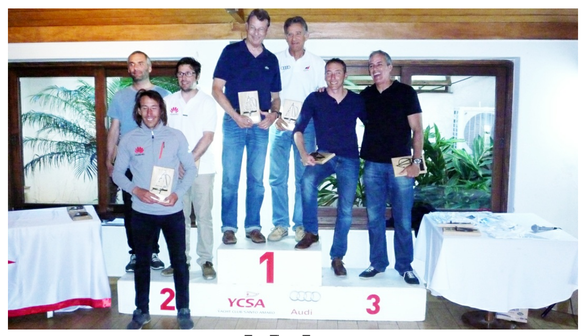
Top Thee Teams

14 teams traveled to Sao Paulo, Brasil for the three day championship. 7 races were held in excellent wind conditions 12-15 knots on the first two days and a little lighter on the third day. Besides the great competition a nice time was had shore side with dinners every night including happy hour and cocktails. A fun time was had by all and more photos will be coming soon!