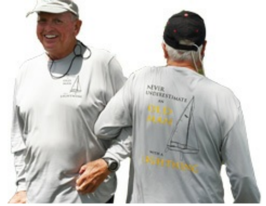
"Never Underestimate an Old Man with a Lightning"

Large two-color image on back and smaller one-color image on the right front area. Classic Lightning Image. Sport-Tek, long sleeved, light gray Tech shirt.